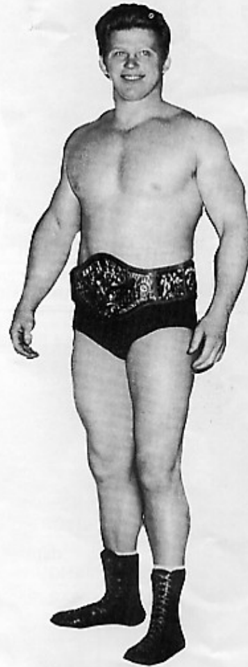
BOB BACKLUND WWF heavyweight champion

The world junior heavyweight title goes on the line tonight, with Britisher Les Thornton defending against Mike Graham. In what has been aptly called a "battle of the giants," Ernie "Big Cat" Ladd takes on 450 pound Andre the Giant. Mr. Florida meets the Super Destroyer with the stipulation that one mask must be removed. And seven top-ranked girl grapplers will vie for a $10,000 battle royal jackpot.