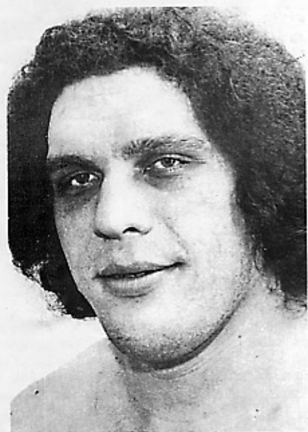
ANDRE THE GIANT