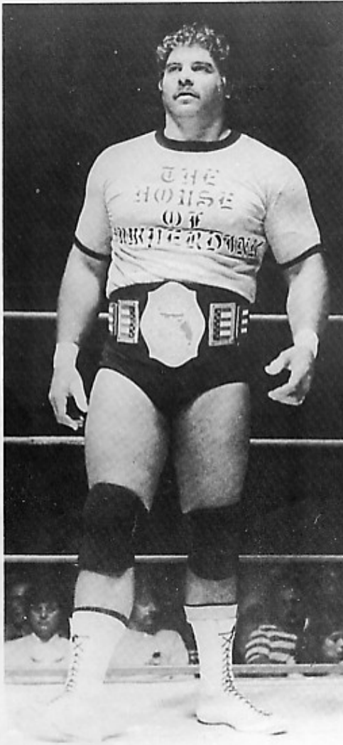
DON MURACO Florida heavyweight champion

Muraco for the WWF heavyweight championship. Bob won the WWF belt from the fabulous Superstar Billy Graham and has defended it against the best competition to be found in the populous northeastern section of the country.