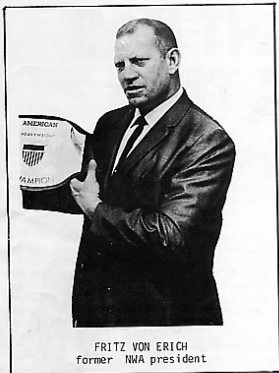
FRITZ VON ERICH former NWA president